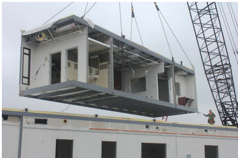
Fig.1 Construction prefabrication

Since the prefabricated building is about half the weight of the traditional building, the requirements for the foundation bearing capacity are also reduced, and the foundation construction is much simplified [3]. After the prefabricated building components of the factory are transported to the construction site, they can be installed and constructed according to the design requirements, as shown in Fig. 1.